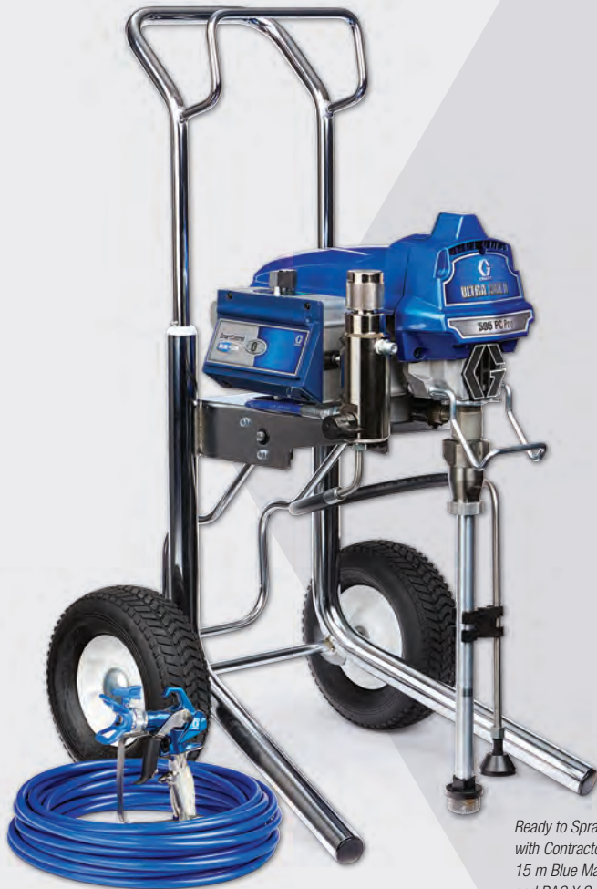
Ready to Spray: Complete with Contractor PC Spray Gun, 15 m Blue Max II hose, and RAC X SwitchTip