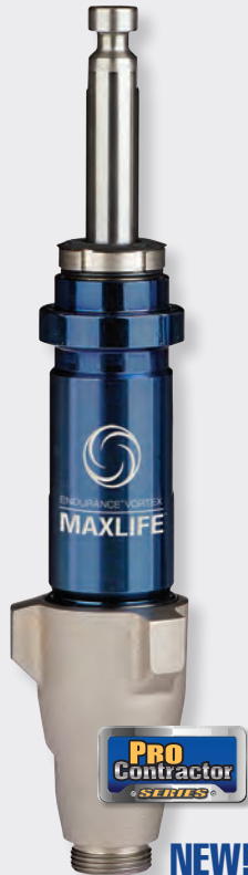
Endurance Vortex MaxLife Pump 6X longer between repacks NEW!