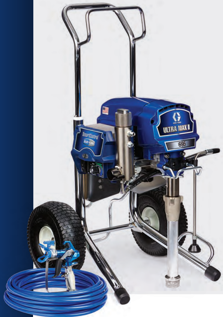
Ready to Spray: Complete with Contractor PC Spray Gun, 15 m Blue Max II hose, and RAC X SwitchTip