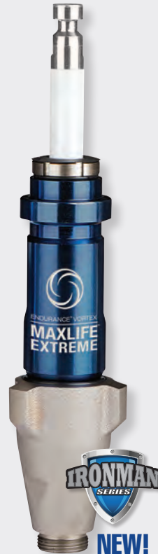
Endurance Vortex MaxLife Extreme Pump Extends pump rod life by 3X — delivering the industry's lowest cost of ownership NEW!