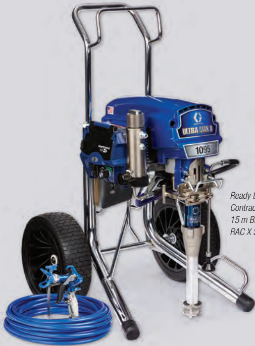
Ready to Spray: Complete with Contractor PC Spray Gun, 15 m Blue Max II hose, and RAC X SwitchTip