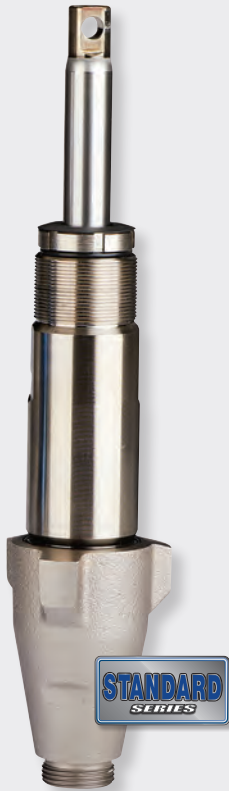
Endurance Chromex™ Pump Lasts 2X longer than competing pumps