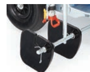
FieldLazer S90 Adjustable Spray Shield