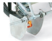
FieldLazer S100 Adjustable Spray Shield